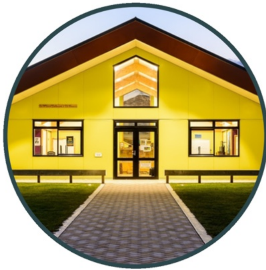
TE MĀTU MOTUEKA HIGH SCHOOL

LABOUR WEEKEND - FRIDAY 25TH - SUNDAY 27TH OCTOBER